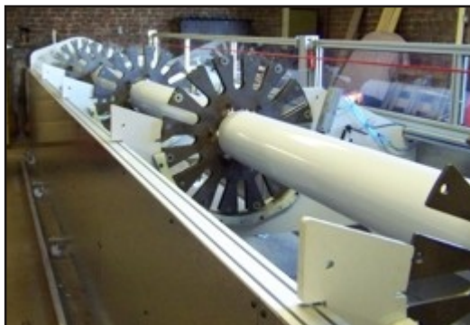
Photo of the 13 metre long tube drilling machine