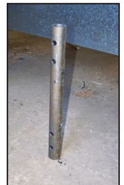
Photo of the finished product