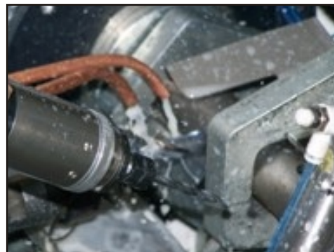
Photo of the drilling operation