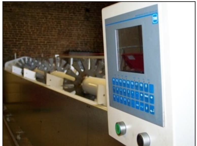
Photo of the 13 metres long machine and TRM 3 axis motion controller.

By using the Motion Application Programme "MAP" our client was able to save money and time in software development. MAP can store up to 200 user programs in memory and each program can have up to 500 lines (commands). The flexibility of MAP means that very complex programs can be created, in this case the program was 250 lines long.