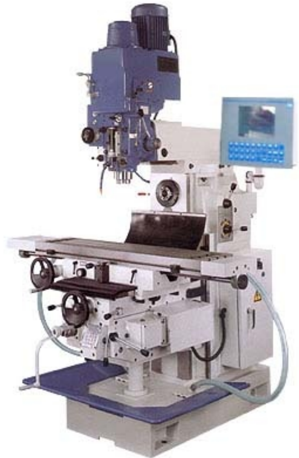
Milling machine with a 2 axis TRM Motion controller

The installation was quick and easy thanks to our pre-made wires and connectors. Once the toothed pulleys, servomotors and electrical cabinet were in place the job was almost done. After plugging all the cables into the electrical cabinet the machine was ready for the initial software parameters to be setup on our Motion Application Programme 'MAP'.