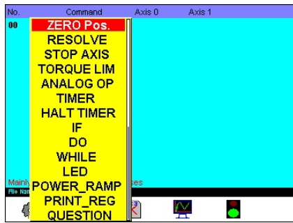
MAP is an end user friendly language adaptable for the majority of applications with 28 commands to choose from.

The controller was programmed using the Motion Application Programme 'MAP' . 'MAP' has been used in a vast variety of machines and applications giving the user a greater control of costs, saving money and time on software development.